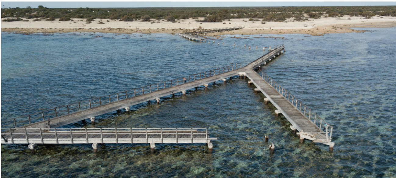
Hamelin Pool walkway damage.